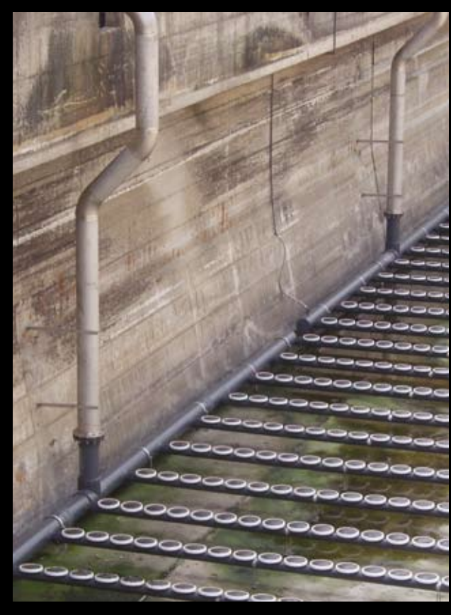
Fixed systems are cost effective for large installations