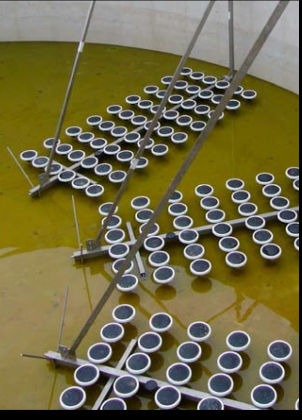
Retractable systems for easy maintenance